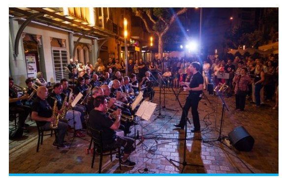
Experience the magic of a live performance in Paris!